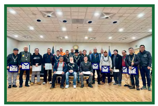
1st and 3rd Degree Proficiencies