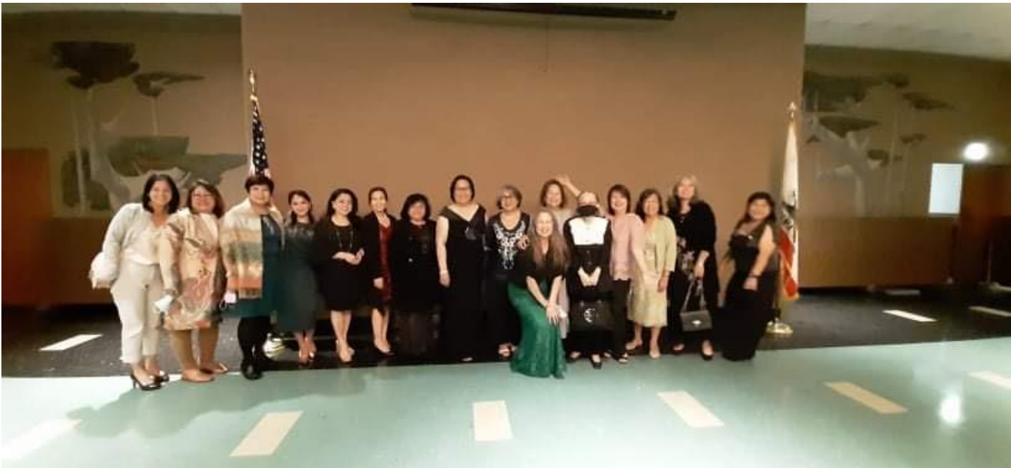
Ladies at the Festive Board