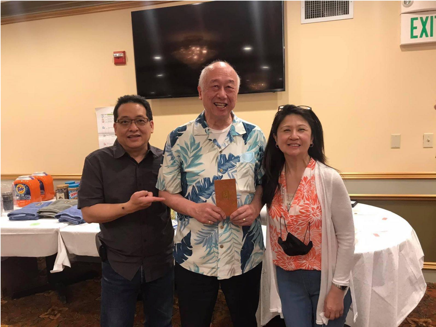
Big Winner! Mid-Autumn Luncheon