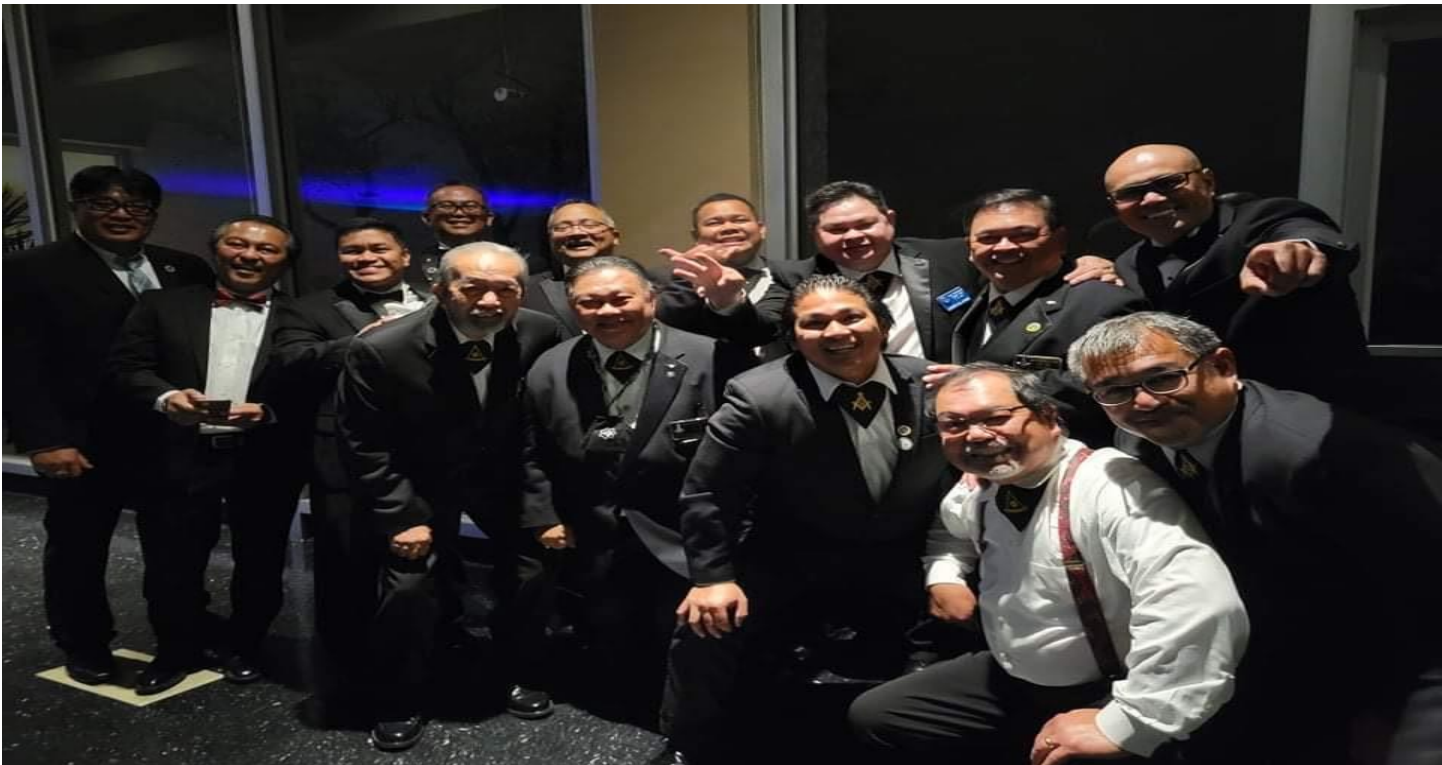
Guys, Festive Board