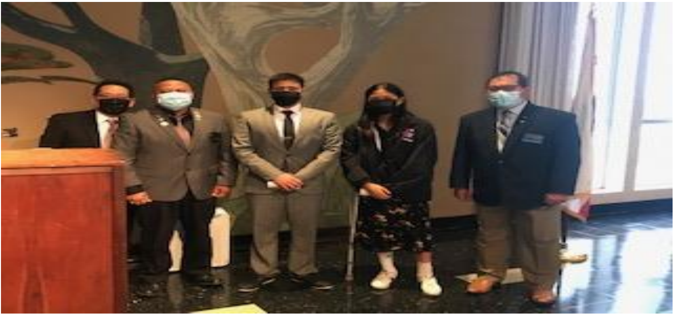
Check presentation to San Francisco Chapter of Demolay and Jobs Daughter Bethel 198