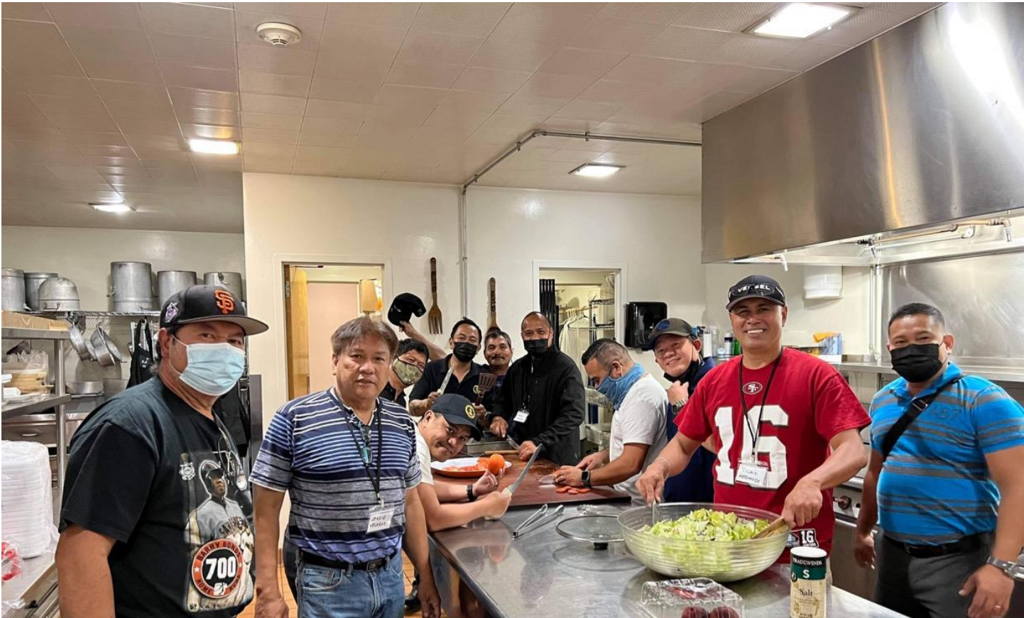
Officer and Degree Team Appreciation Night