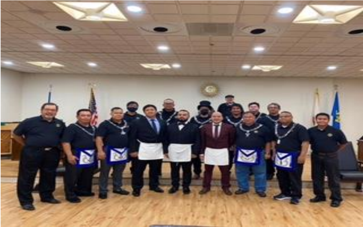
Triple First Degree Conferral!