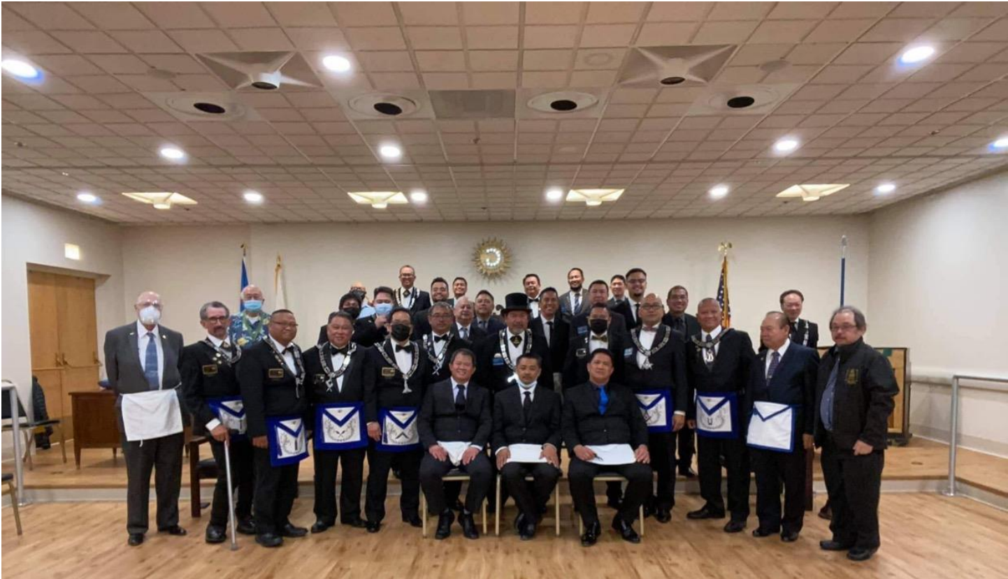
Triple Second Degree Conferral