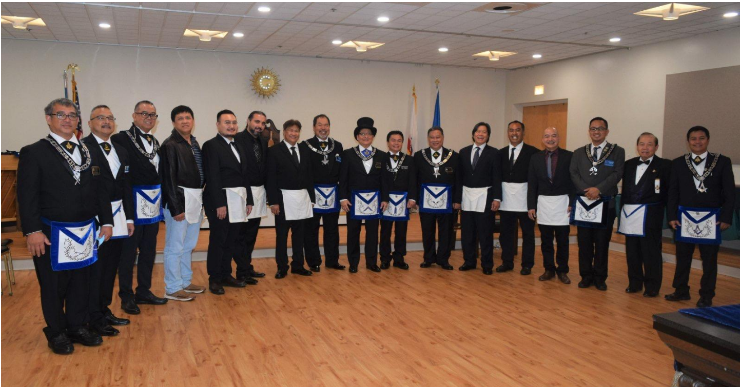
Quintuple First Degree Conferral